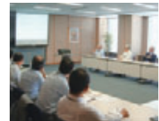
Meeting of the Risk Management Committee

Initiatives during the fiscal year included the preparation of a business continuity plan (BCP) assuming the occurrence of a major earthquake, formulation of measures for dealing with the new influenza strain, and the establishment of a contact system for quick and accurate communication within the Group.